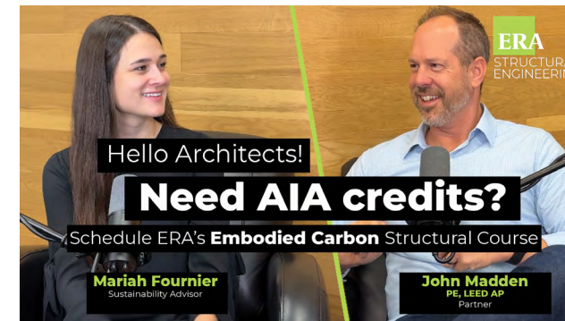
Podcast-style promotional video for ERA's AIA-accredited Embodied Carbon Course

ERA has also engaged with the Carbon Leadership Forum Minnesota by attending virtual roundtable meetings to: